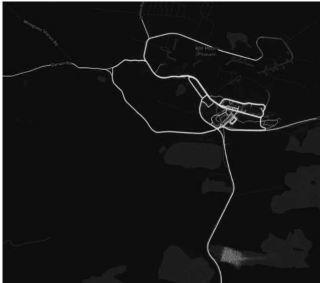
Figure 1. Digital life at the RAF Mount Pleasant, the Falkland Islands. Photo: Strava heatmap showing digital bodies at RAF Mount Pleasant in the Falkland Islands. < https://labs.strava.com/heatmap/#13.00/13.00888/55.59811/hot/all > (last accessed 9 February 2018). With kind permission from Strava.