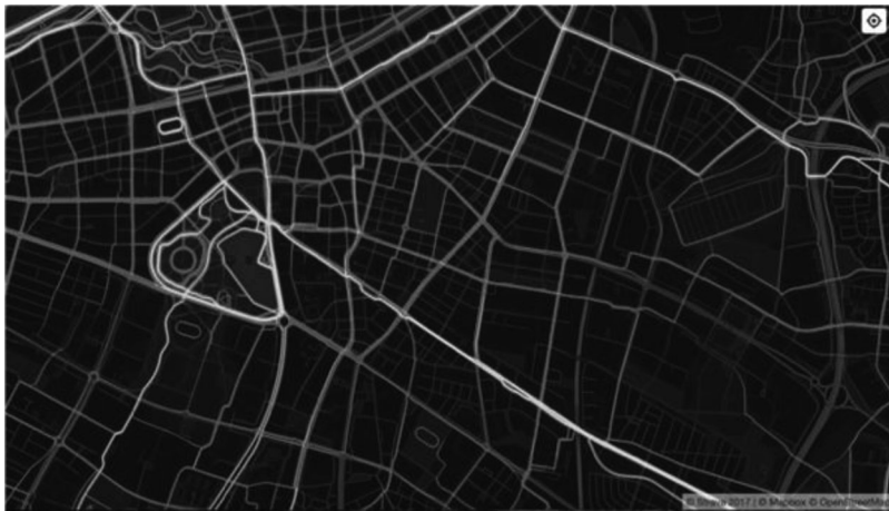
Figure 2. Digital life at Värnhem, Malmö, Sweden. Photo: Strava heatmap showing digital bodies at Värnhem < https://labs.strava.com/heatmap/#13.00/13.00888/55.59811/hot/all > (last accessed 9 February 2018). With kind permission from Strava.

Recalling the principle of distinction in IHL it becomes important to note that the digital body does not necessarily perform ‘one’ (male/uniform/combatant) or ‘other’ (female/non-uniform/civilian) form of life or gender: it entangles, in other words, but